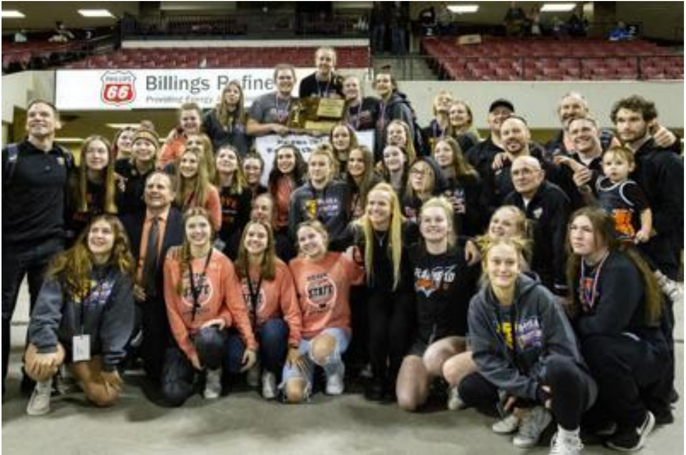
The Flathead Bravettes pose with the girls wrestling state championship trophy Saturday night at First Interstate Arena at MetraPark.