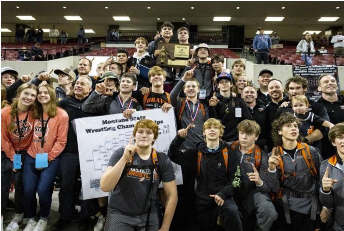
The Flathead Braves pose for pictures with the Class AA State Championship trophy after the finals of the MHSAA State Wrestling tournament at First Interstate Arena in Billings on Saturday, Feb. 12, 2022.

Feb 12, 2022