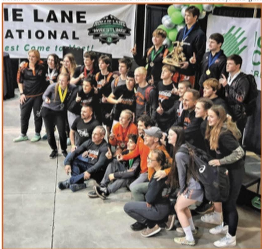
2022 Boile Lane Invitational - Flathead High School from Kalispell, Montana wins the team championship in both the boys and girls divisions.